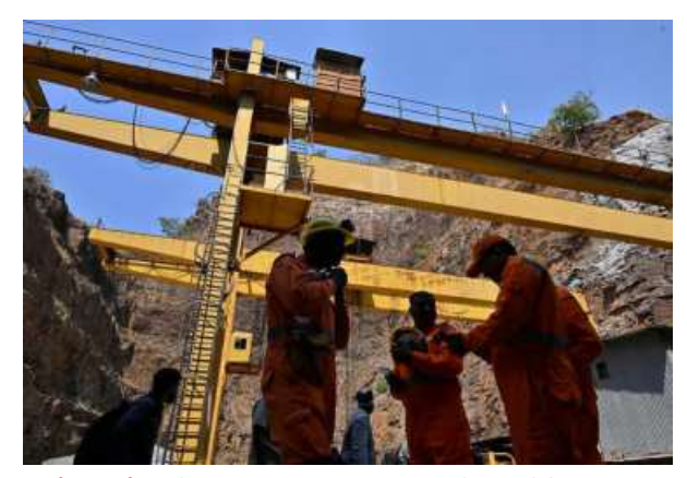
Accident site: The SLBC project area in Nagarkurnool district on Monday. A portion of the tunnel has collapsed. NAGARA GOPAL

"The crack teams comprising experienced personnel from the Army, Na-National Disaster VV. Response Force (NDRF), State Disaster Response Force (SDRF), National